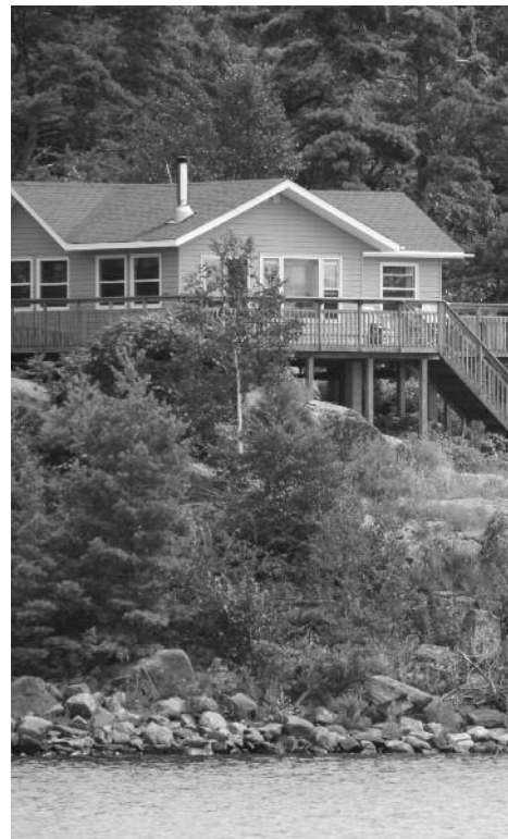
Cottage on Haggis Island

The following morning, as we were setting the Corsair free of our boat, two Boston Whalers drove by the boats creating a wake. These boats had several people on board and they seemed to be going around and