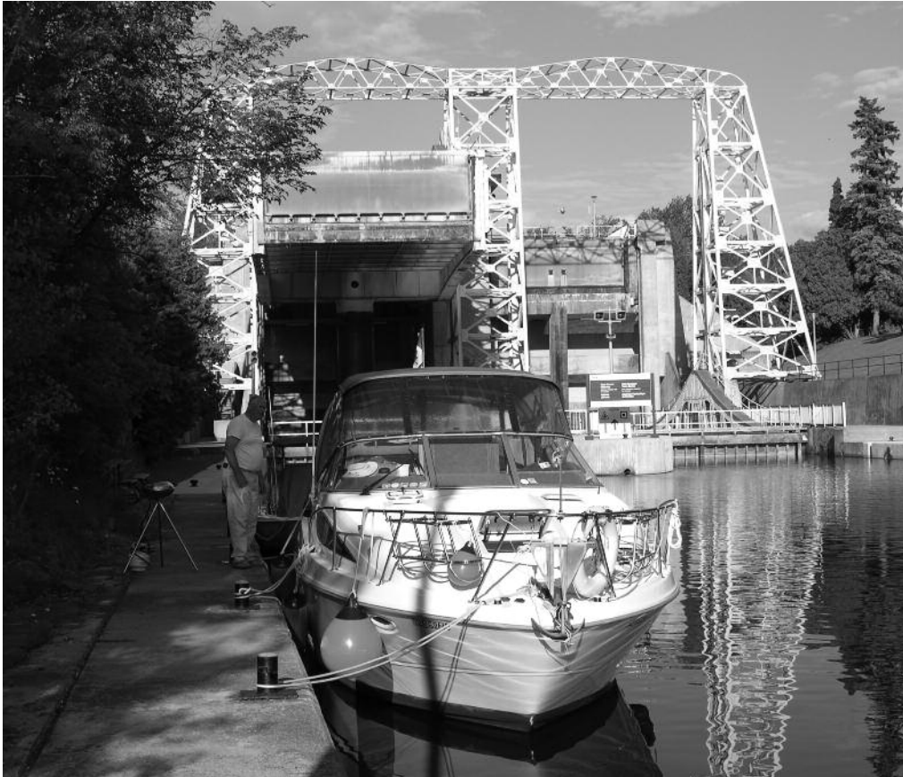
A share of our gas taxes should be re-invested into the boating infrastructure

Ontario's MNR. As an example, look at provincial parks on the water, like Killbear, that want boaters to put a fee in an envelope if they come to shore, but offer no docks or safe tie up facilities. There are shower facilities, but boaters are tacitly discouraged from using them.